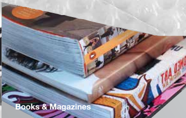
Books &amp; Magazines