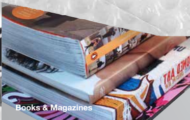
Books & Magazines